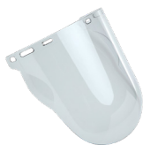
CHINGUARD CLEAR VISOR