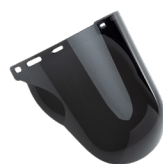
CHINGUARD SMOKE VISOR