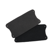
BROWGUARD SWEAT BAND