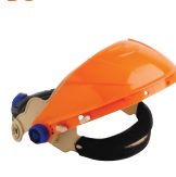
BROWGUARD WITH RATCHET HEADGEAR