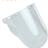
CHINGUARD CLEAR VISOR