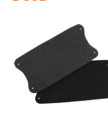
BROWGUARD SWEAT BAND