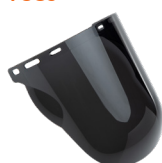
CHINGUARD SMOKE VISOR