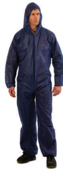
Product Code: DOB