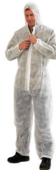
Product Code: DOW

Materials : Single Layer Polypropylene Base Weight : 40 gsm Colours : Blue and White Part code : DOW (White), DOB (Blue) Sizes : M- 3XL Qty/Carton : 50